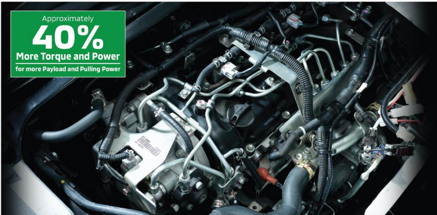
Euro 4-compliant 2.2L Turbocharged and Intercooled CRDi engine

Approximately 40% More Torque and Power for more Payload and Pulling Power